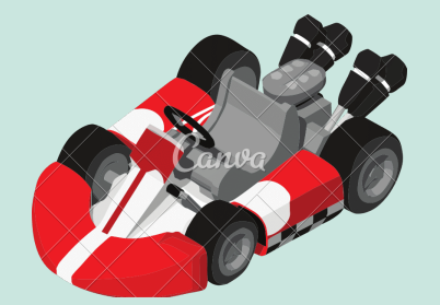
Starting @10am Excursion: $22

Race with your friends or have a quite drive around the track.