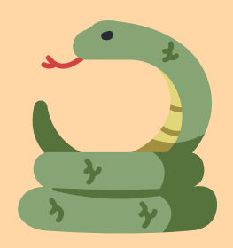
Starting @ 10am Excursion: $12

Well today is the day! The amazing team from Wildcall Wildlife is bringing their wildlife show to POP.